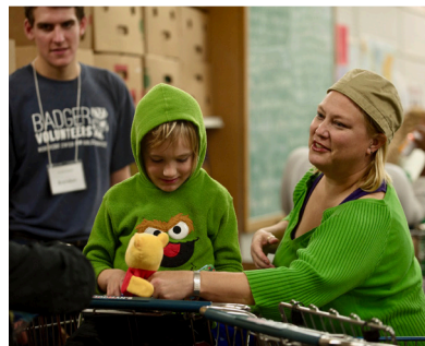
The River serves over 650 households every week with groceries, clothing and hot meals.

There are many reasons why a person walks through The River's door. Many need that little assistance of