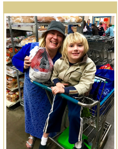
Thanks to the many kind and selfless people in the community that gave the Gift of Gobble, 760 families were able to receive a turkey for their Thanksgiving dinner.