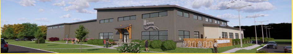
Rendering by Ramaker & Associates

Learn more at riverfoodpantry.org/recipe-for-hope .